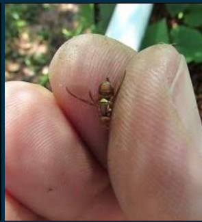
Queensland Fruit Fly, damaged tomato.