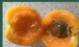
QFF larvae in apricot.