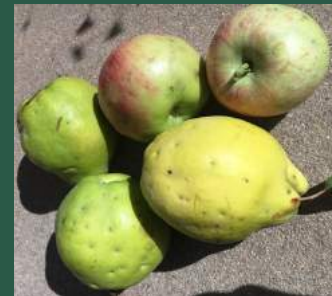
QFF damaged fruit

Notify the Yarra Valley coordinator. Use bait, traps and netting.