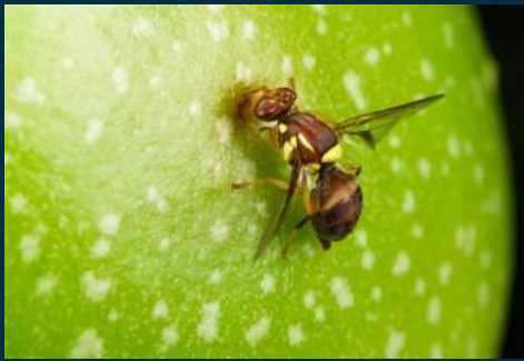
Queensland Fruit Fly.