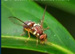
QFF adult