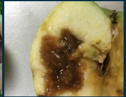
Queensland Fruit Fly larvae in apple.